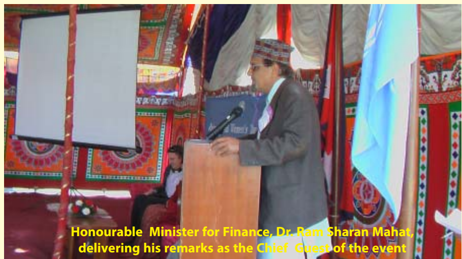
Honourable Minister for Finance, Dr. Ram Sharan Mahat, delivering his remarks as the Chief Guest of the event

start his own tailoring business. Three years later, she was unanimously elected, first as the Chairperson of District Micro-entrepreneurs Association and after two years at the national level.