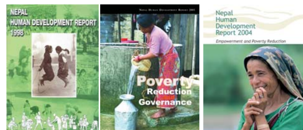
The 1998, 2001 and 2004 Nepal Human Development Reports

The global Human Development Report, 2007/08 ranks Nepal as the South Asian country with the lowest level of human development. Although levels of income poverty have dropped considerably in Nepal — from 42% in 1996 to 31% in 2004 — social and regional inequality in income distribution and consumption has grown. The poorest 20% of the population's share in the national income decreased from 7.5% to 6% in the same period.