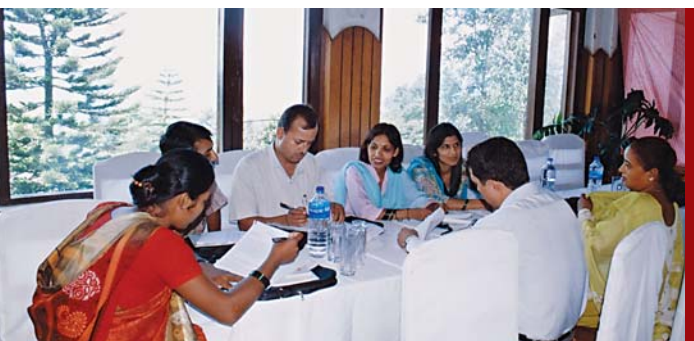
Mediation training for lawyers

As of February 2009, this project needs a further $800,000 to implement all its planned activities.