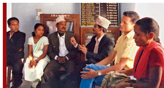
A mediation session between disputants in Tanahun

Implemented in: Central level justice agencies and 7 district courts