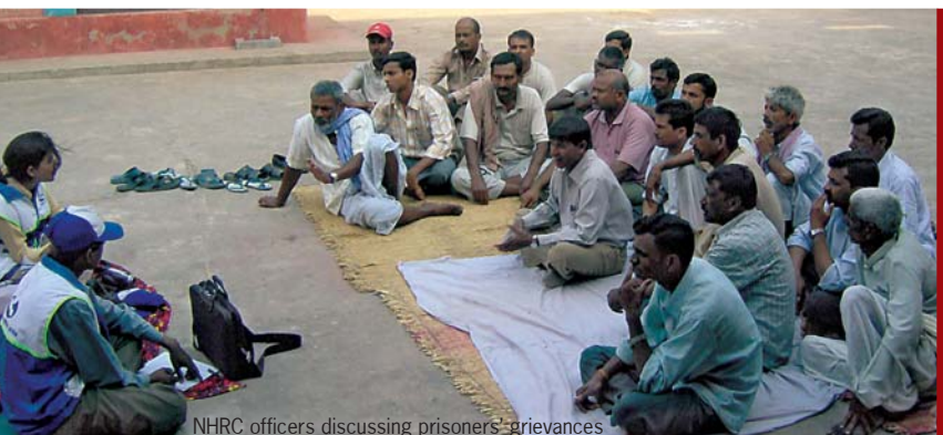
NHRC officers discussing prisoners' grievances