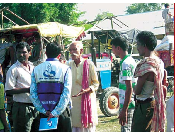
An NHRC officer investigating a human rights incident

The five-year-long Phase 1 helped the commission establish itself as a force for protecting and promoting human rights. The project helped it set up its basic infrastructure, its management and IT systems, and a network of four regional offices and five district contact offices for monitoring the human rights situation across the country. This included setting up a system for the commission's core task of handling complaints and monitoring human rights violations. The commission now deals with hundreds of cases a year and in the first 11 months of 2008 investigated a total of 207 cases.