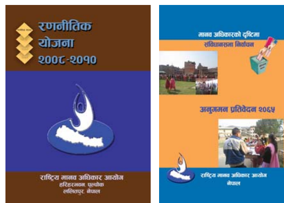
NHRC's strategic plan, 2008–2010 and its election monitoring report